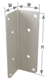
ML26-TZ (ML24-TZ similar)