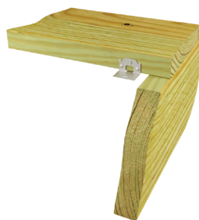
Typical DC50-TZ installation